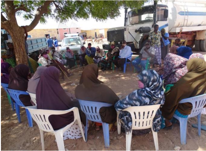
Market Assessment Figure 2: Beneficiary training