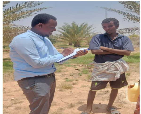
Figure 3: Project team conducting market assessment